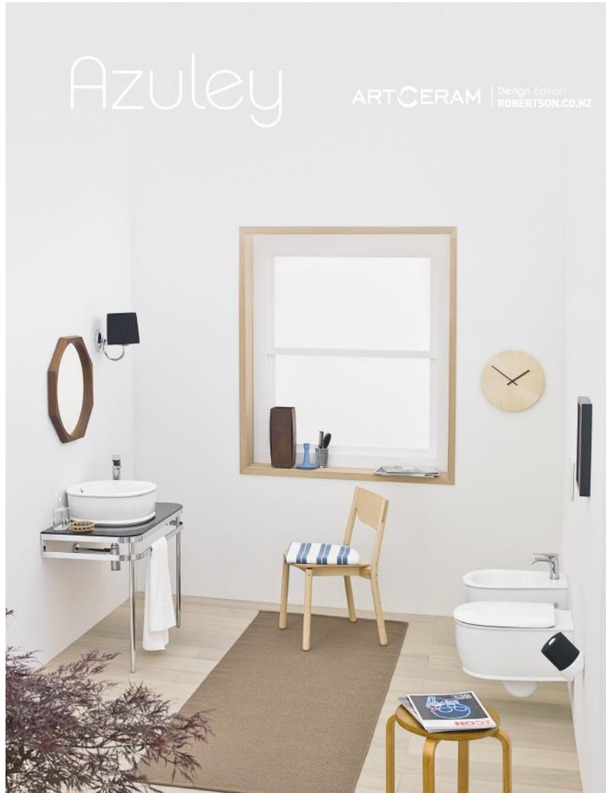
Denizen | Art Ceram – Azuley